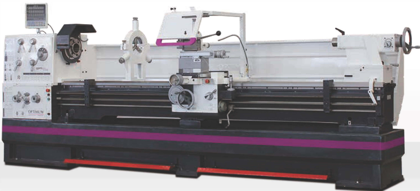
Fig.: TH 8030D